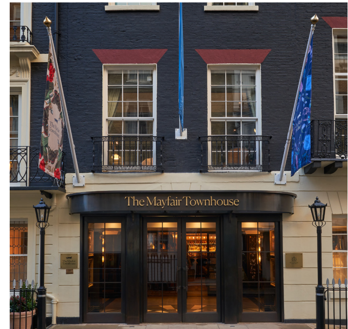
THE MAYFAIR TOWNHOUSE, LONDON. ENGLAND