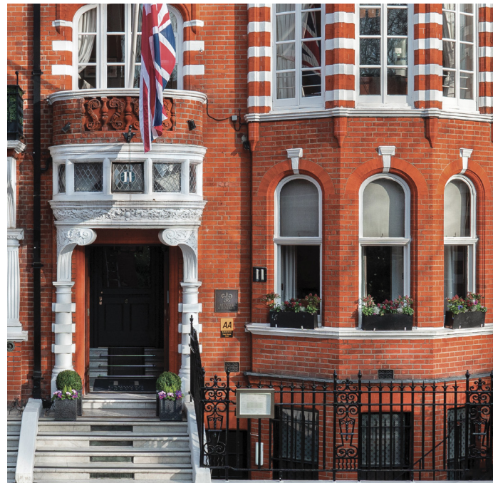
11 CADOGAN GARDENS, LONDON. ENGLAND