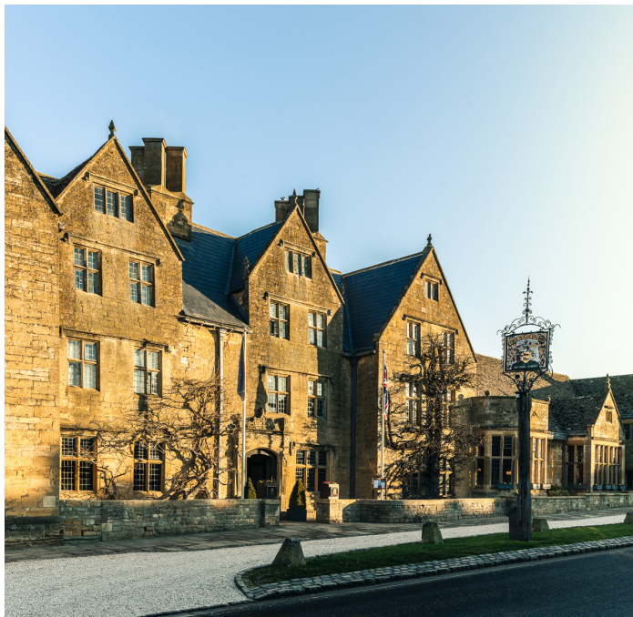
THE LYGON ARMS, COTSWOLDS. ENGLAND